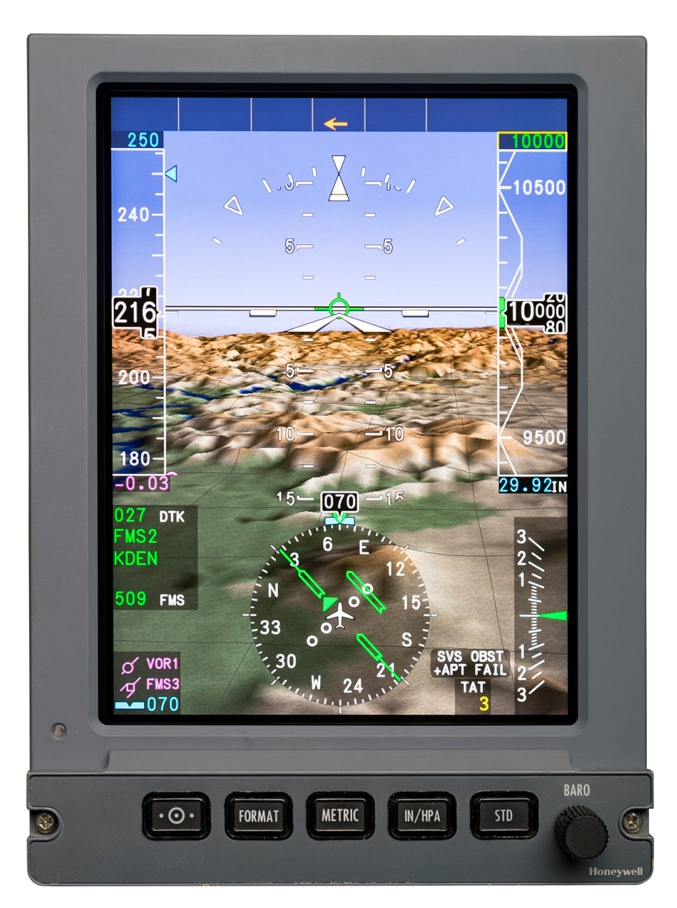
Wouldn't you rather see as you fly it – in color and in three dimensions – rather than the old blue-over-brown?

This seamless integration of terrain, runways and obstacles makes Primus Elite the most advanced synthetic vision upgrade in business aviation.