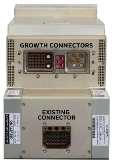
Form / Fit, "plug and play" makes it easy to replace old CRT displays using the existing connector and additional connectors for future growth programs

Option 2: DU-875 Replacement through Maintenance Service Plan - Avionics, replace DU-870 upon failure with a DU-875.